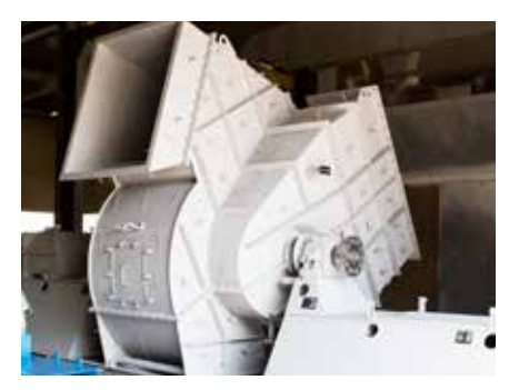
Heavy duty industrial fans for harsh environments: POLLRICH fans are tailor-made to the latest standards and ensure a safe waste combustion.